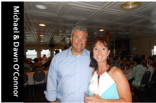
Family of the Year